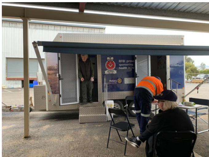
MHERV in Quirindi - August 3rd.