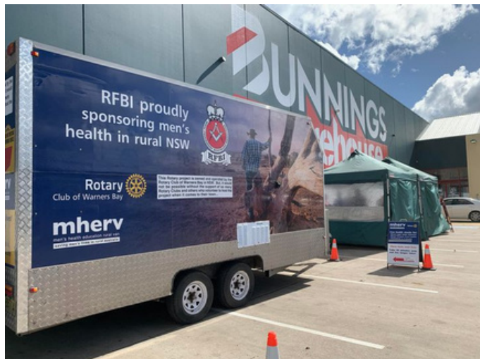
MHERV in Tamworth - August 6th - 9th Outside Bunnings and near the sausage sizzle.