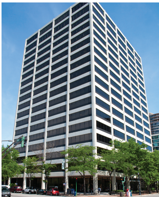
One Rotary Center in Evanston, Illinois, USA

Rotary International is administered by the Secretariat, which comprises the general secretary and nearly 800 employees who work to support clubs and districts around the world. Rotary's world headquarters is in Evanston, Illinois, USA, in a building called One Rotary Center. It includes a 190-seat auditorium, Rotary's archives, and an executive suite with conference rooms for the RI Board of Directors and Rotary Foundation Trustees and the offices of the