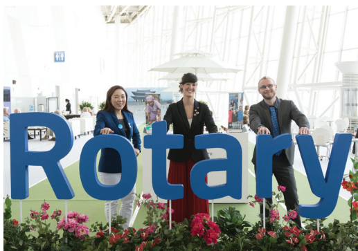
Attendees at 2016 Rotary International Convention, Korea