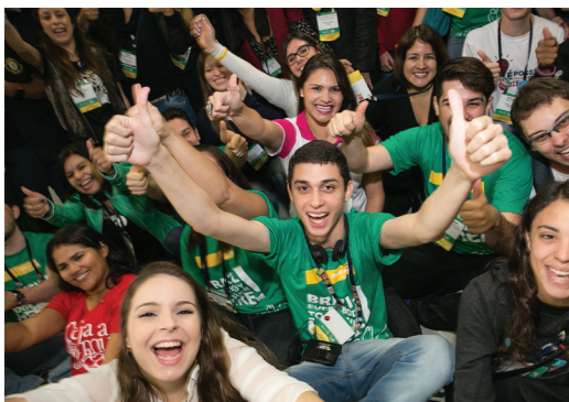
Rotaract members meet yearly before the convention.

We believe in investing in our future by empowering young leaders, helping them learn leadership skills, and giving them opportunities to have cross-cultural experiences.