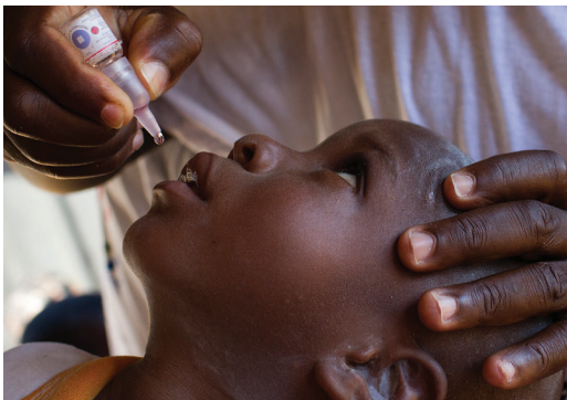
Rotarian administering polio vaccine in Nigeria, Africa

Our members’ and others’ contributions to the Foundation allow us to bring sustainable change to communities in need. Ask your club’s Rotary Foundation committee chair or visit rotary.org/donate to learn how you can support our Foundation. To learn more, download The Rotary Foundation Reference Guide or take the Rotary Foundation Basics course in Rotary’s Learning Center .