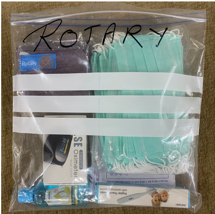
COVID-19 Support Kit

They have built 400 kits with a goal of 1000. Each kit is $50 so we need $30,000. Any amount will help. The Rancho Bernardo Rotary Club Foundation Inc will collect money for forwarding to The Rotary Club of Agra Tajmahal. Please forward any donations to https://gofund.me/1b96ae60 or RB Rotary Club Foundation, PO Box 28501, San Diego, CA 92198-0501. Make checks payable to RB Rotary Club Foundation and write "India COVID Relief" in the memo line. Thanks in advance for your contribution to this urgent cause that means so much to us.