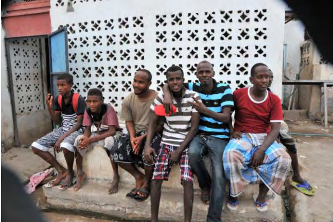
09 - Local kids in the town of Dikhill.. . Yep, you heard it right. The sign was just a few feet from them.