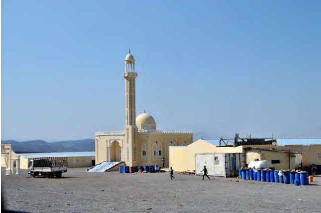
03 - A typical house in the region.