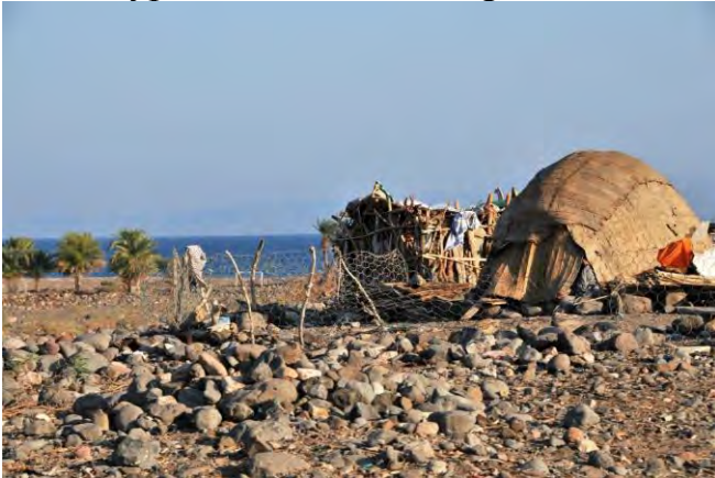
04 – Actually, this is one of the better living conditions we have seen so far.