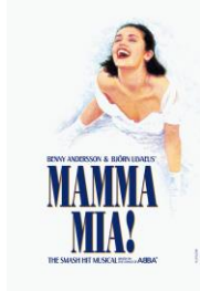
MAMMA MIA! June

Believe it or not (since tickets for the summer season go on sale so early in the year), it is time for us to choose which of the musical productions we want to see at the Moonlight Amphitheatre. Here is the lineup: