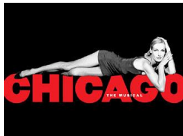
CHICAGO THE MUSICAL September