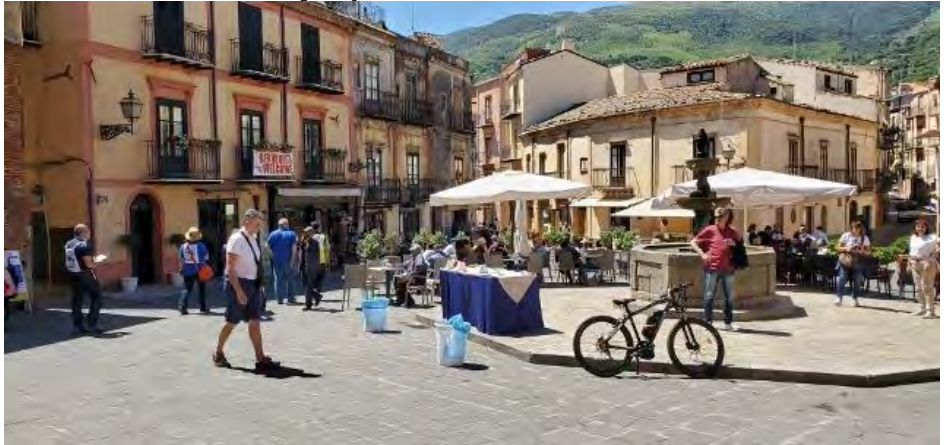
The central town Castelbuono