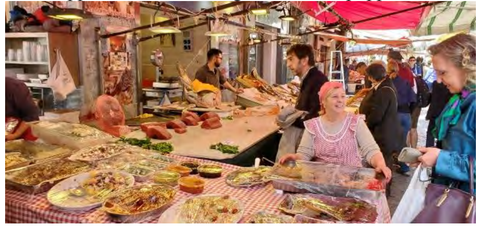
Daily open market in Palermo