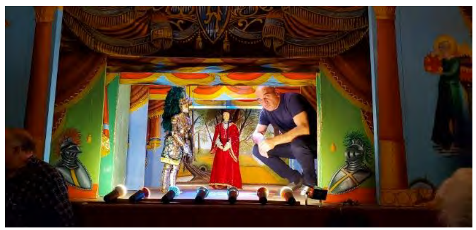
Puppet Show with 4th generation of puppeteers