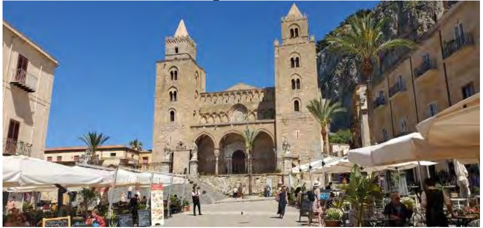
The central plaza Cefalu