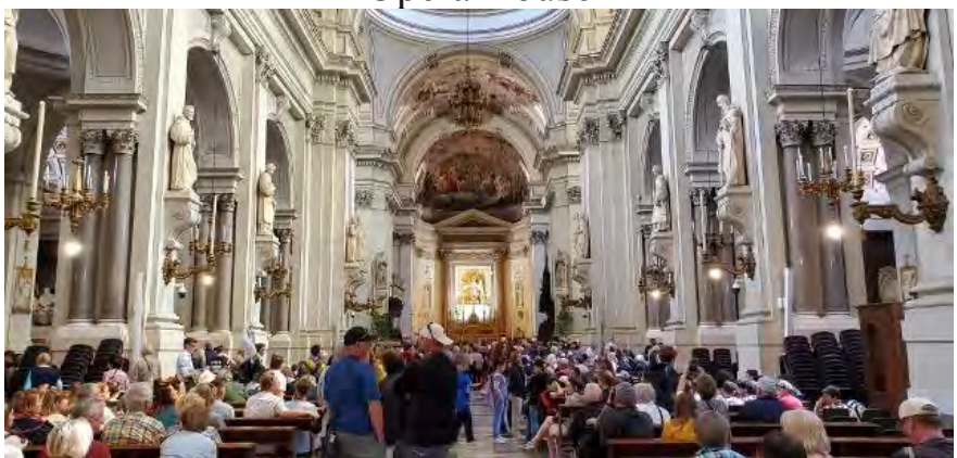
Inside National Cathedral