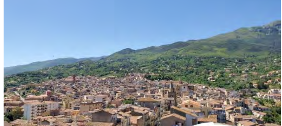
Village of Cefalu