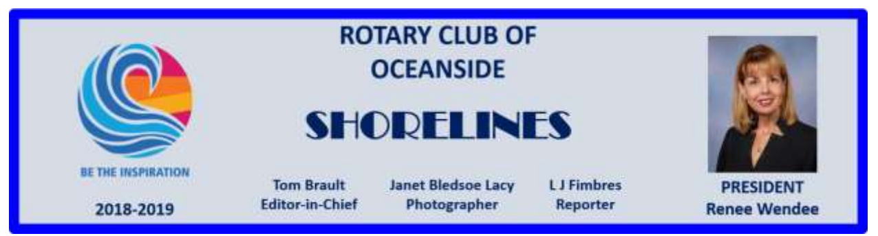
May 31, 2019