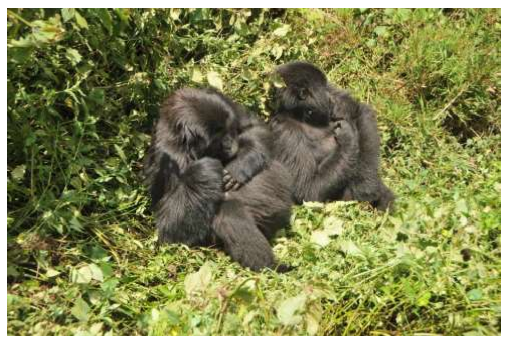
Photo shots of the Gorilla family in the wild in Rwanda at Volcano National Park at the altitude of 9,600 feet. You can see how dense the canopy is where they live.