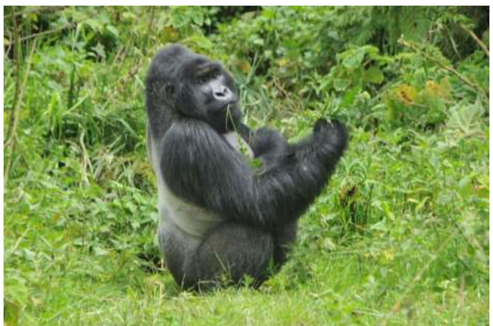
A few more shots of the Gorillas in the wild... What an adventure to be so close in the wild!