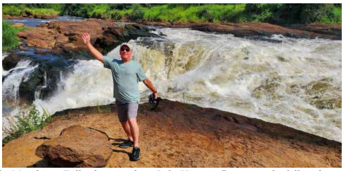
The Murchison Falls photo is where Lake Victoria flows over the falls to become the mouth of the Nile River below, which we had seen the day prior, then flowing through Uganda to Sudan to Egypt and into the Mediterranean."