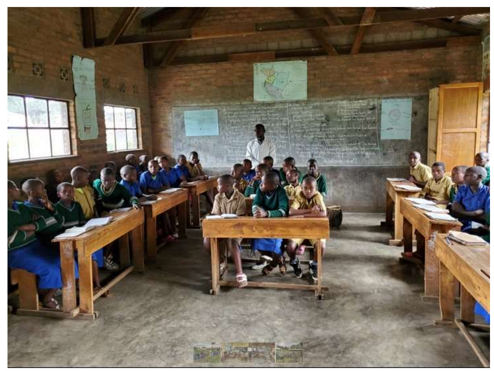
Also shots at the local school. Classrooms in Ruhengeri, Rwanda, the gateway city to Volcanoes National Park. There was not one lightbulb in all the school.