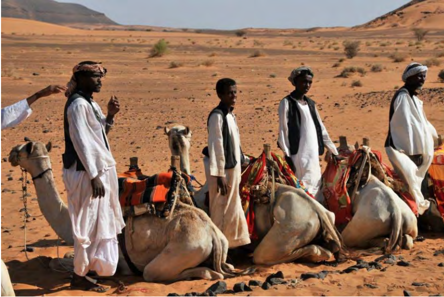
(20) Camel drivers