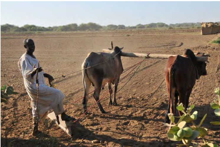
(17) The tractor in Sudan today... has not changed in thousands of years