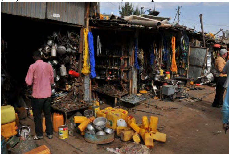
(05) You name it, it is here at the market