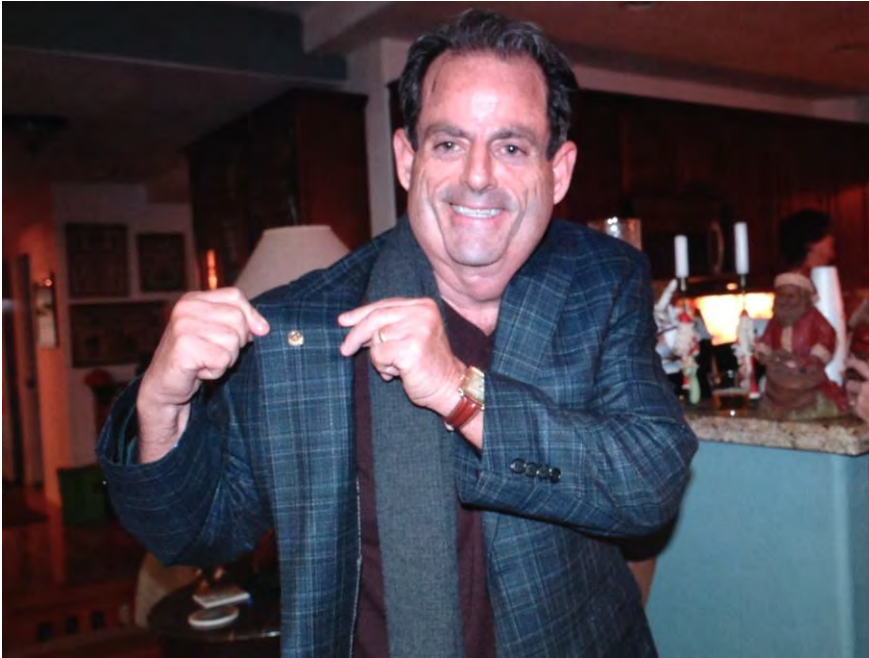
(19) OOPS, Wrong Picture!