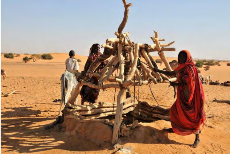
(16) Bedouin women pulling water from 200 foot well in the middle of the desert