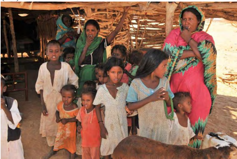
(11) Two mothers with their Bedouin children. You can see a house behind you. Ladies, do not ever complain about your granite counters or lack of sinks in a bathroom again.