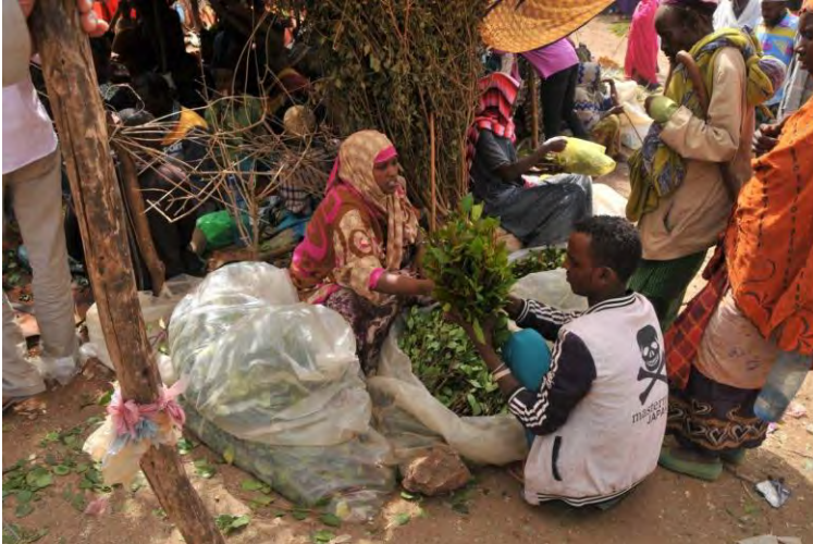
(09) Buying Chat – a drug that you eat sugar cane with and smoke in a cigarette. Chat abuse is an epidemic in Ethiopia