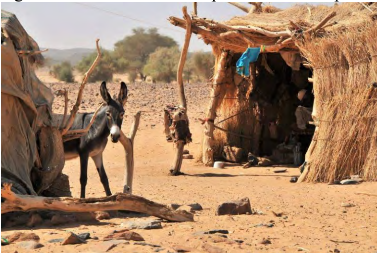
(10) Welcome home to a Bedouin home