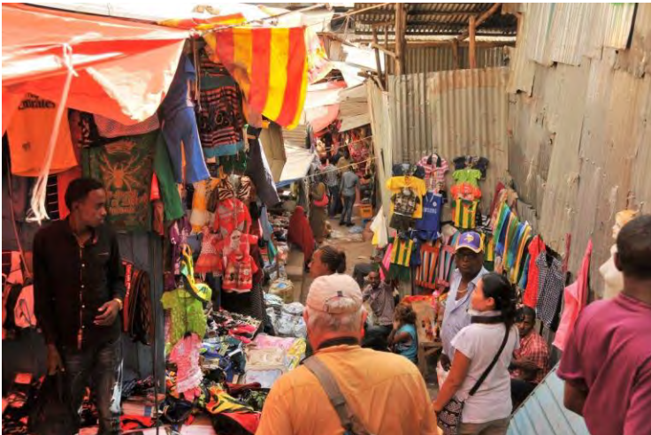
(04) Market in Dire Dawa, Ethiopia