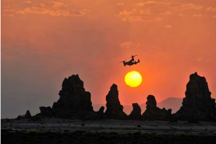
(03) Steam blasting chimneys on the Afar at Sunset with a United States Marines Osprey from most likely Camp Pendleton flying over the sunset. What are the odds of this???