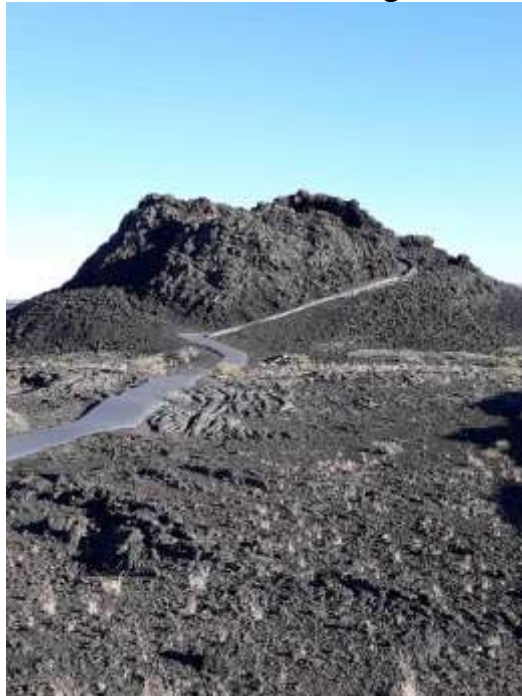
A photo of Craters of the Moon, in Arco ID