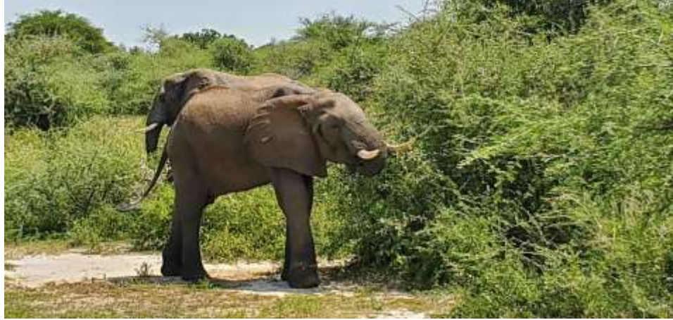
14 Elephants came up to the vehicle almost. We had to move forward from them.