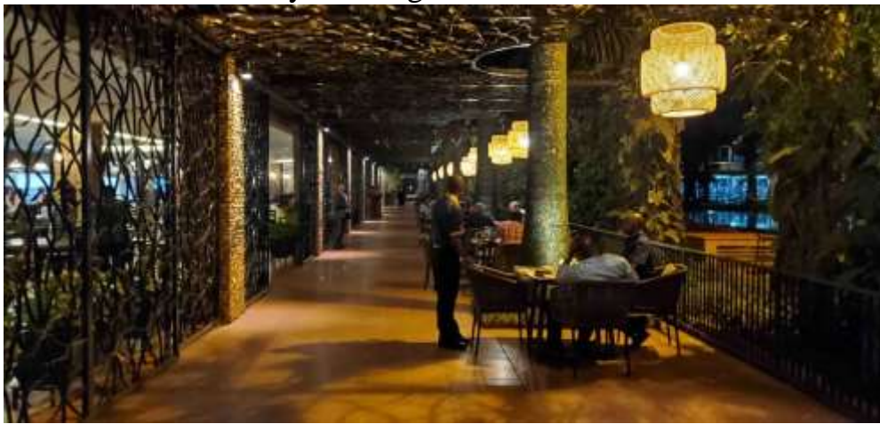
12 Exquisite dining room - Outside dining in the heart of the crazy city.