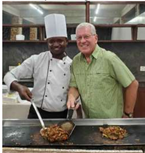
09 Helping to cook Mongolian Barbecue at a local restaurant.