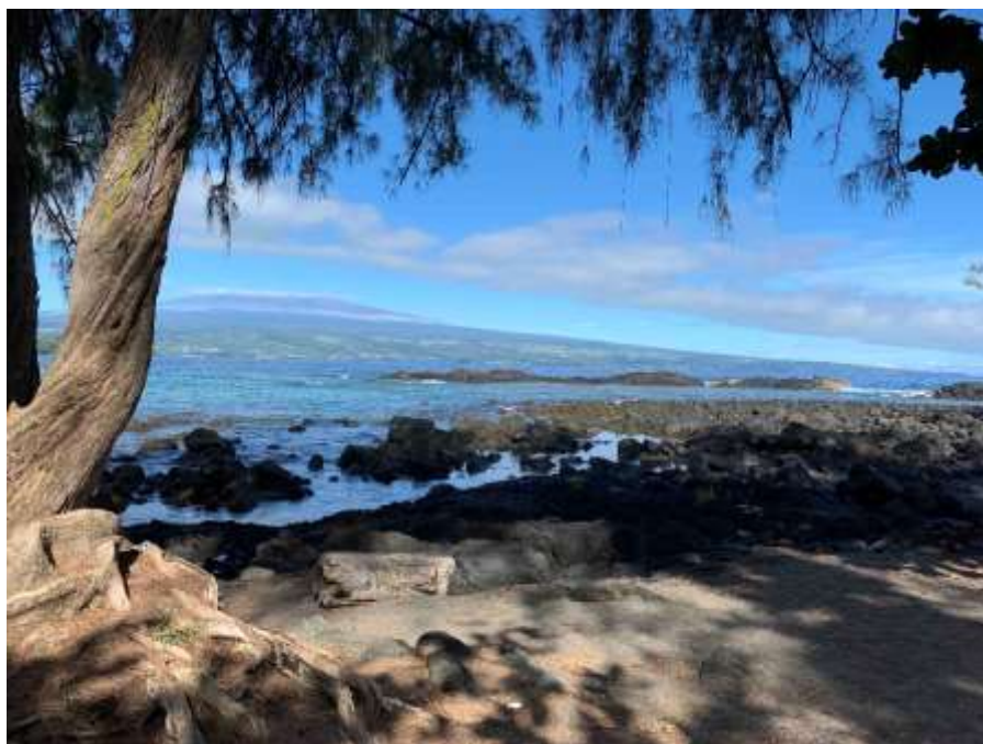
View of a black sand beach