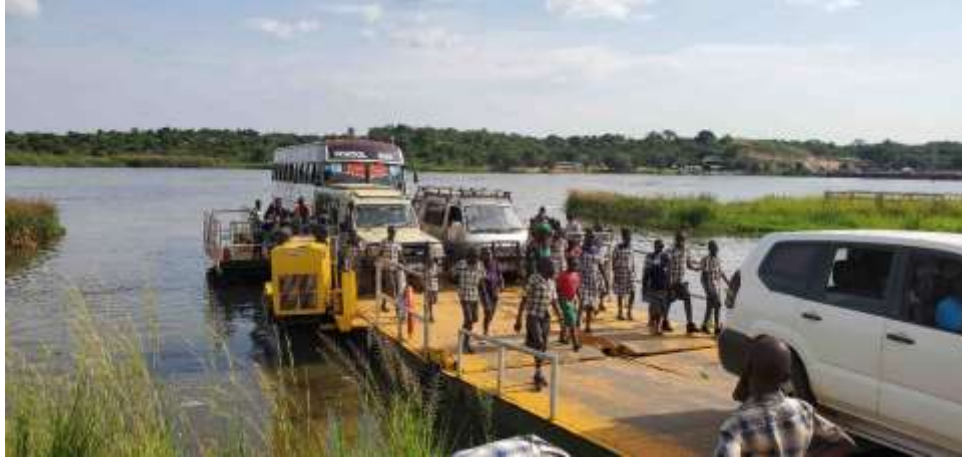
11 Ferry crossing of White Nile River