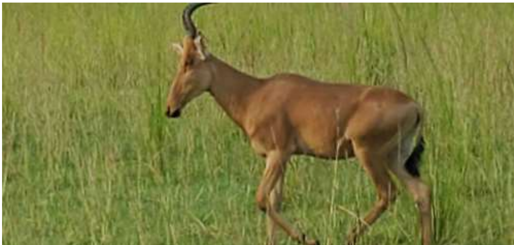
16 Thousands of Jackson Hartbeest. It is spring here and we are south of the equator. The animals are mating. Birds flapping wings in dances, Animals in heat.. and lots more.