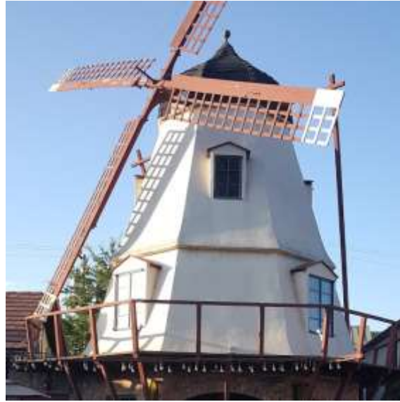
A windmill in Solvang, CA

Not to be outdone, JAY CRAWFORD and Anita Romaine emailed a series of photos from their 28 day, 4,400 mile trip through CA, NV, ID, MT, WY, SD, CO, and UT.