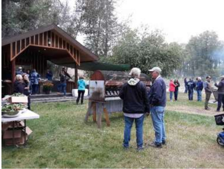
A pepper roasting party in Bozeman, MT. (You can see the huge pepper roaster.)