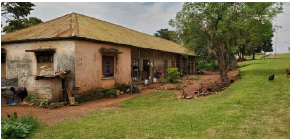
06. Military housing for guards that guard the Presidential Palace.