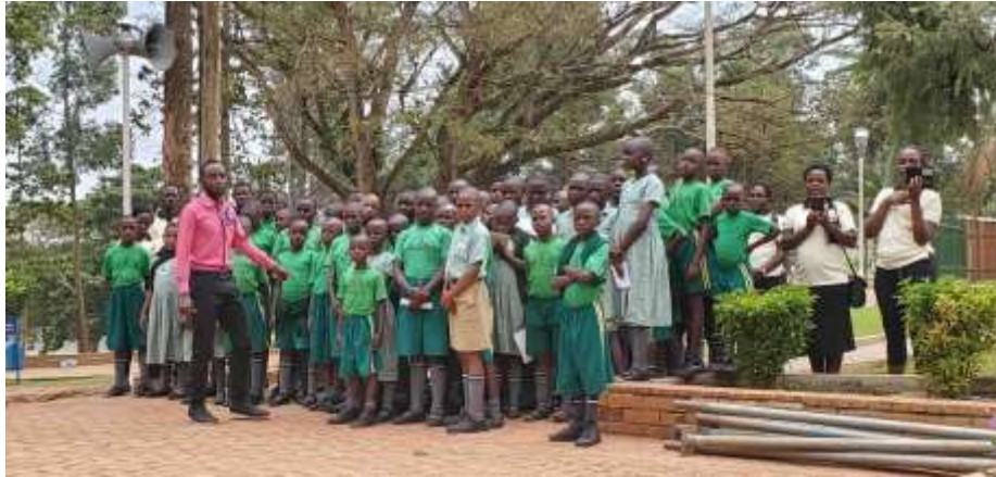
02 Local students on a field trip.