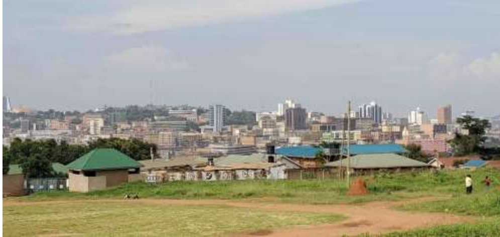
08 New city of Kampana in distance