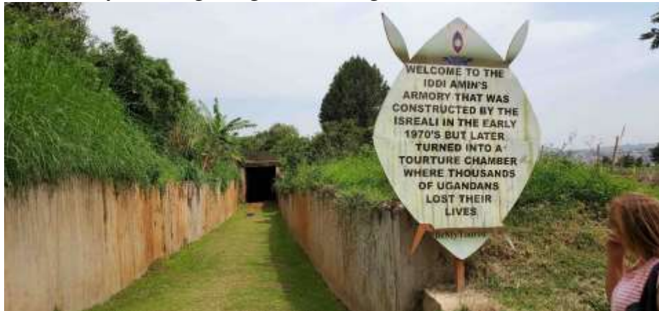
07 Entrance to Idi Amin's torture chamber. Over 25 000 killed