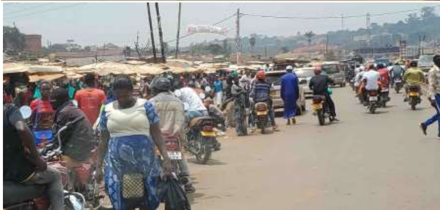
03 & 04 Traffic is treacherous in Kampala. In Uganda, motorcycles serve as taxis. They are called Boda Boda.