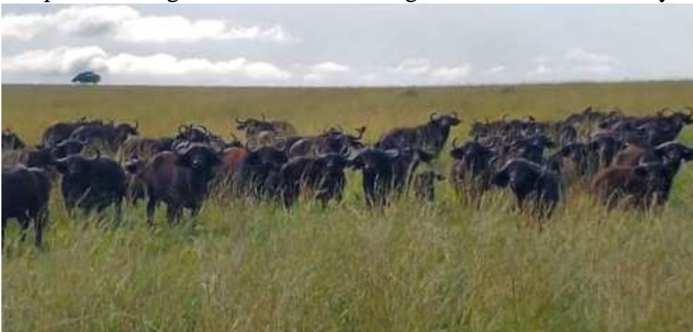
13 Masses of buffalo