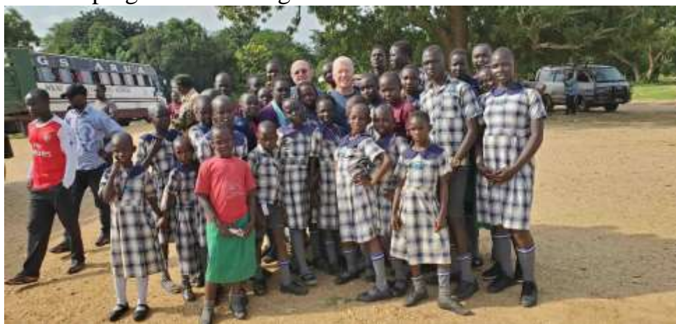
10 Made a whole bunch of new friends today