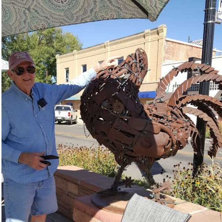
Mike, The Headless Chicken Statue in Fruita, CO. Mike lived 18 months after his head was chopped off. (No kidding...Google it)!