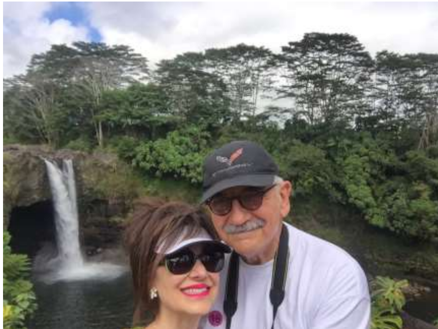
At Rainbow Falls in Hilo, Hawaii