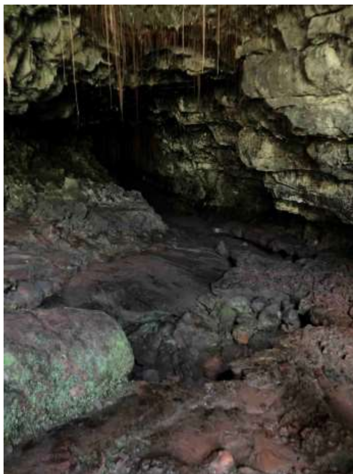
Checking out a lava tube