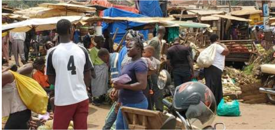
05 Local market. Talk about confusion! You name it. It is found here