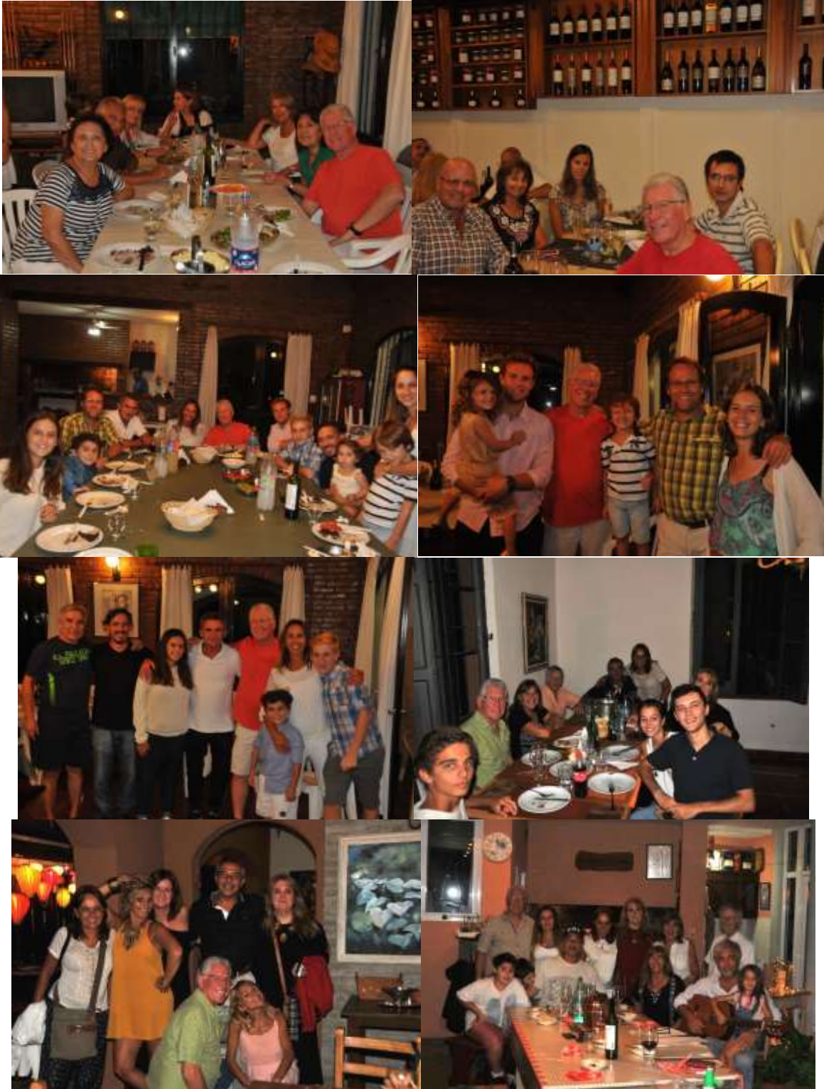
Included in this collection of pictures are: a reunion with various Rotarians from Parana; visits with various local Rotarian families; and (in the last one in this photo series) the gathering of Rotarians from Gualeguaychu (pronounced like “wally why chew”) for a festive barbecue asado.