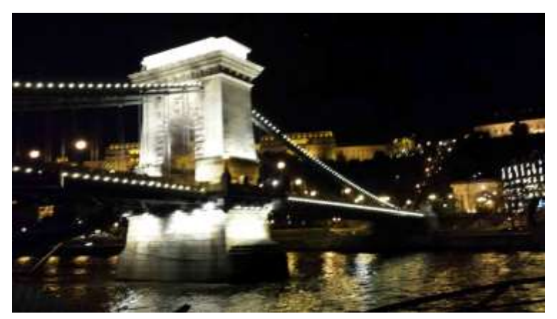
Chain Bridge over Danube River, Budapest