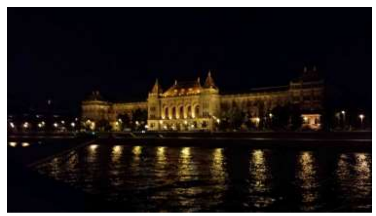
Buildings along the Danube, Budapest, Hungary at night