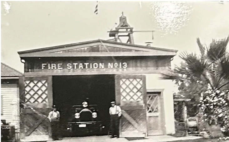
The 1913 original 7877 Herschel Avenue Firehouse #13.