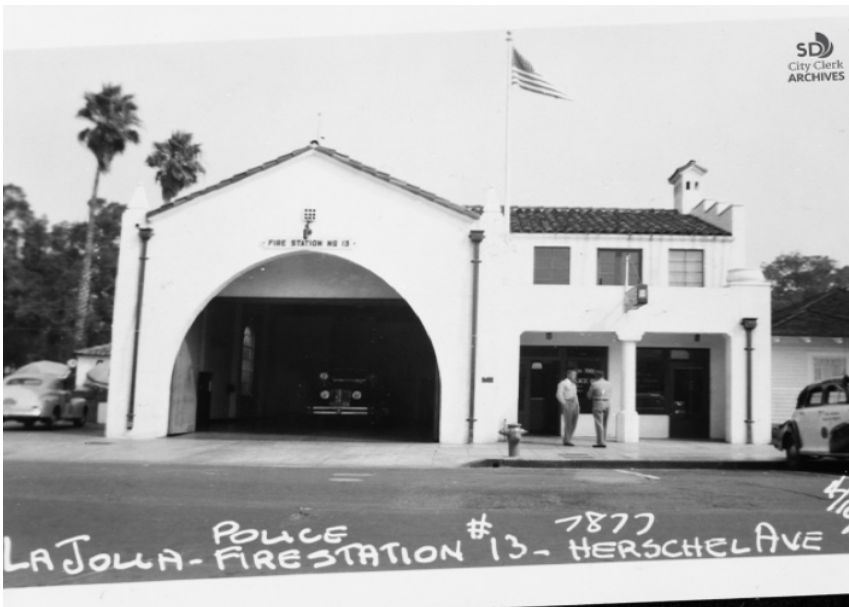
Photo taken of the Herschel property in the 1940s, note the police car. The police used this facility as a substation until 1968 when they moved out and eventually moved into the Northern Division Police Department in 1971.

In 1976, the Fire Department moved Station #13 to 809 Nautilus, where it remains today. The old fire station building stood vacant for nearly 10 years. In the 1980s the YMCA leased the property. In 2013, the YMCA sought to revitalize the building as part of a satellite branch for the La Jolla Village community.