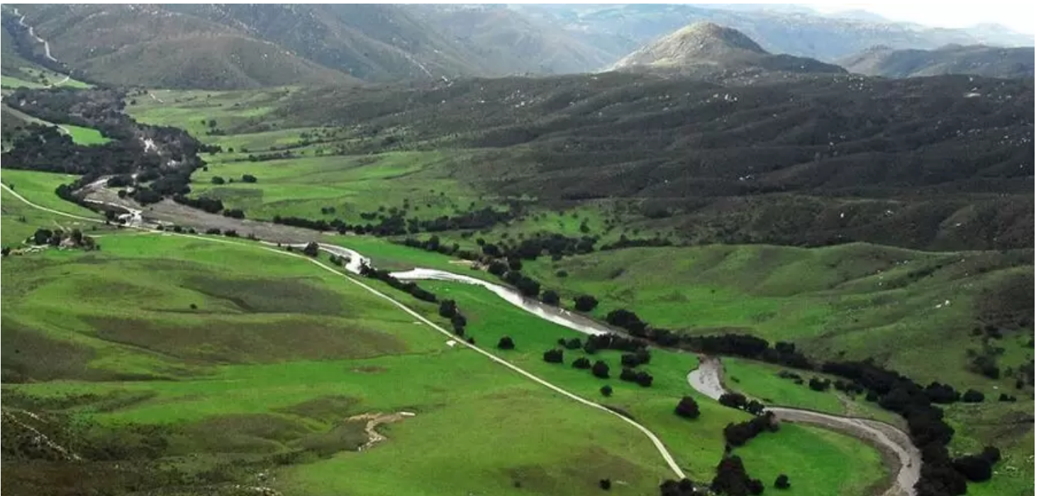
Part of the Beautiful San Dieguito Trail