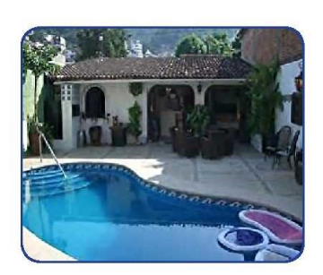
WIN 4 nights in Puerto Vallarta PLUS $250 cash