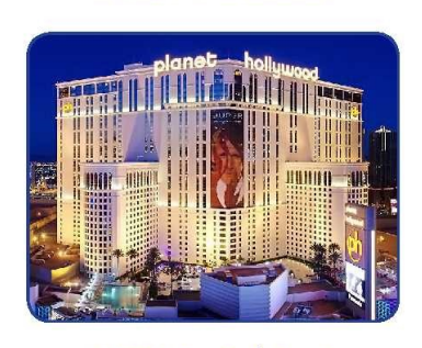
WIN 3 nights at Planet Hollywood in Las Vegas PLUS $250 cash