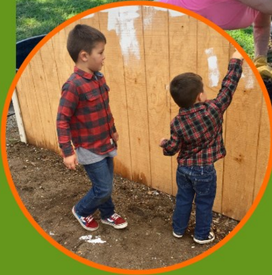
WEED AND TRASH REMOVAL