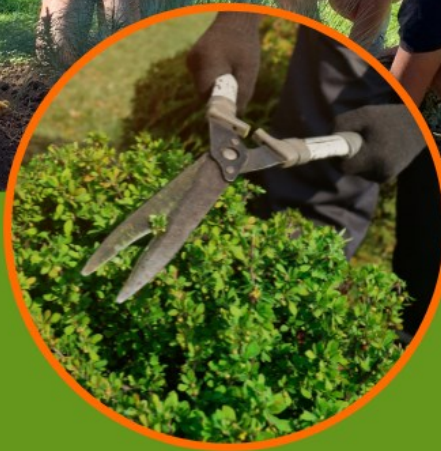
PLANT & TREE PRUNING AND PLANTING