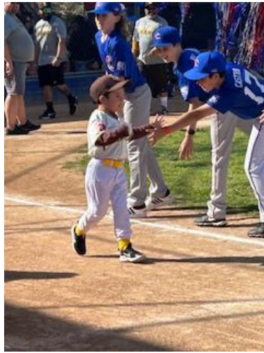
T-ballers running the bases.