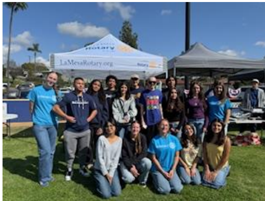
GH Interact Group