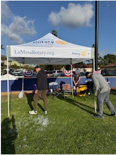
Our new pop-up tent.