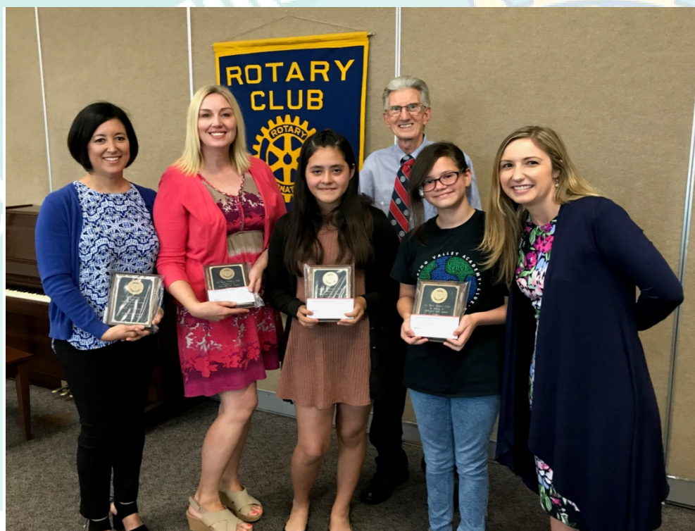
Lambert Award Recipients from Spring Valley Academy!