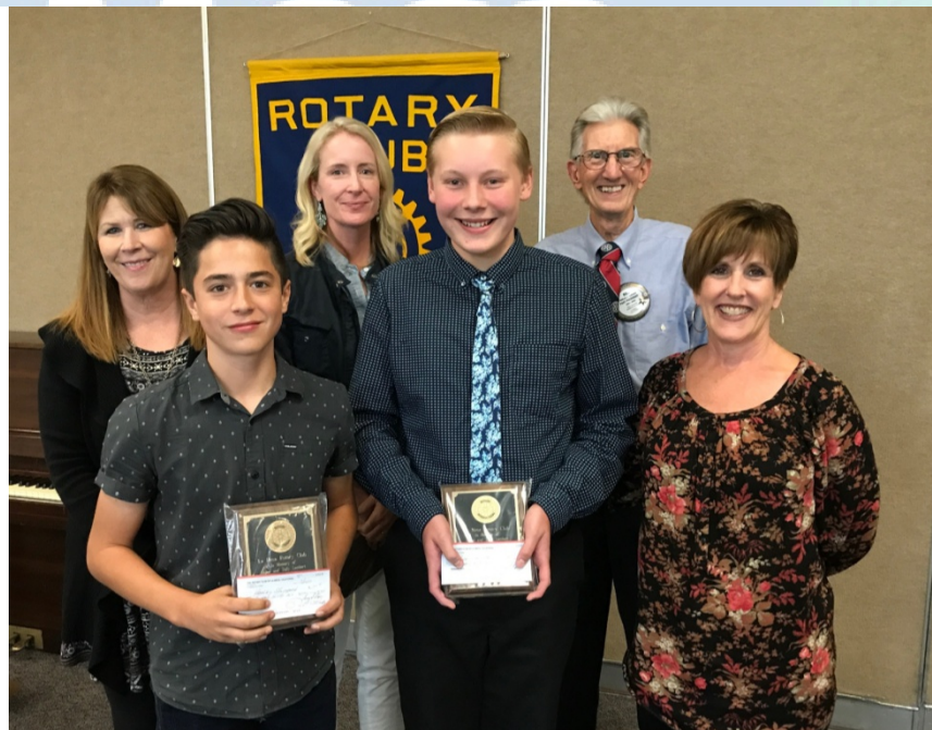
Lambert Award Recipients from La Mesa Arts Academy Center!