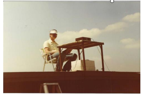
Safety First! Unknown Rotarian manning the press box from a high spot.