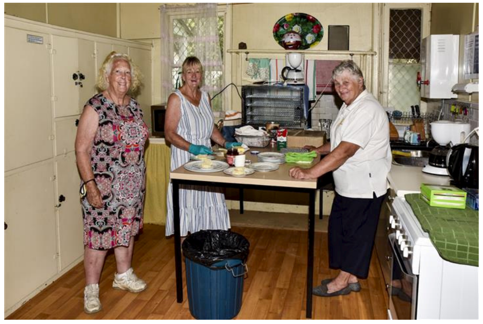
The three hard workers behind the scenes for Scone time at Historic Marthaville Cottage held on Fridays at 10 - 12am. Come along and enjoy the free scones.