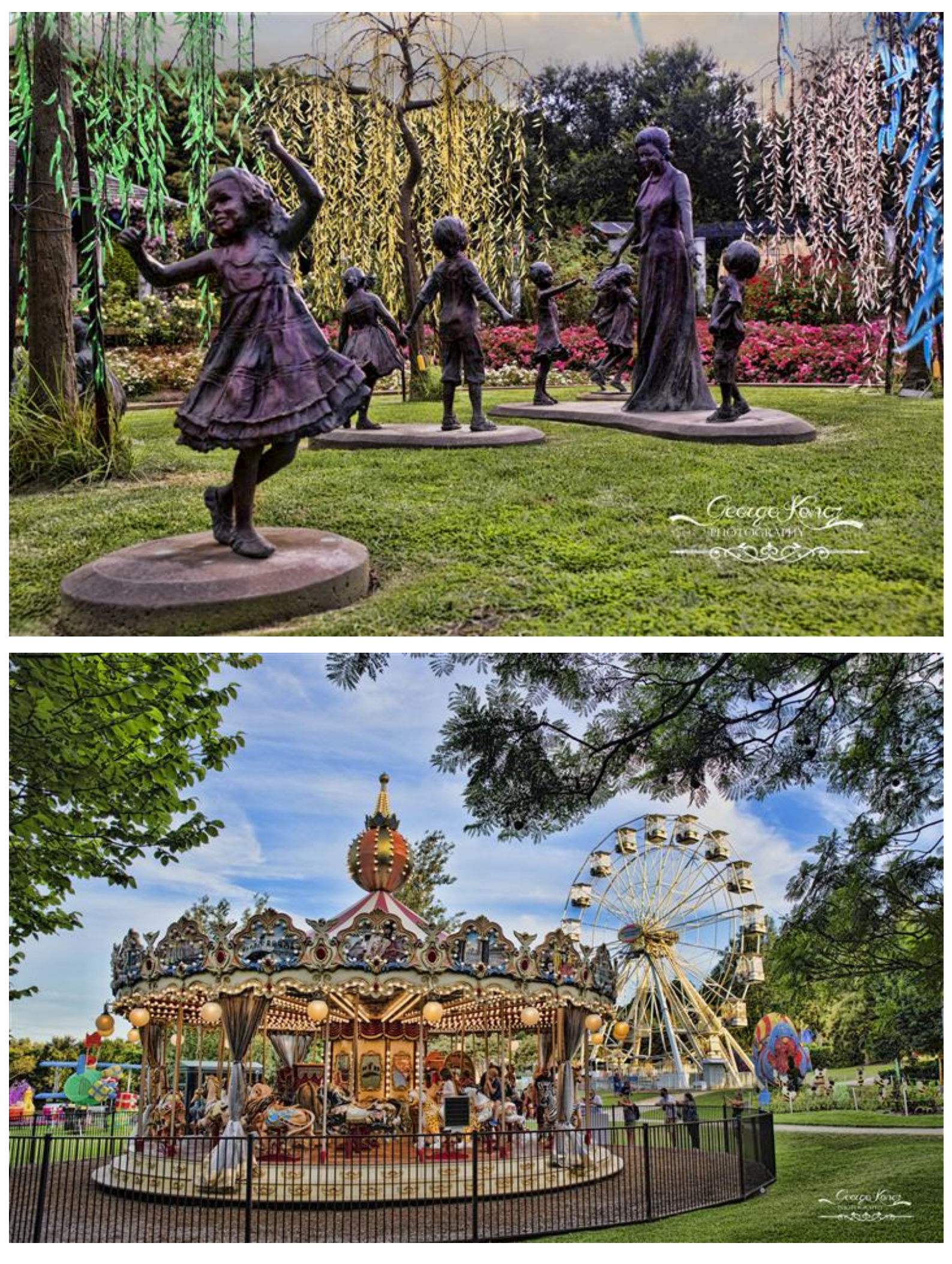
Hunter Valley Garden Lights Spectacular highlights