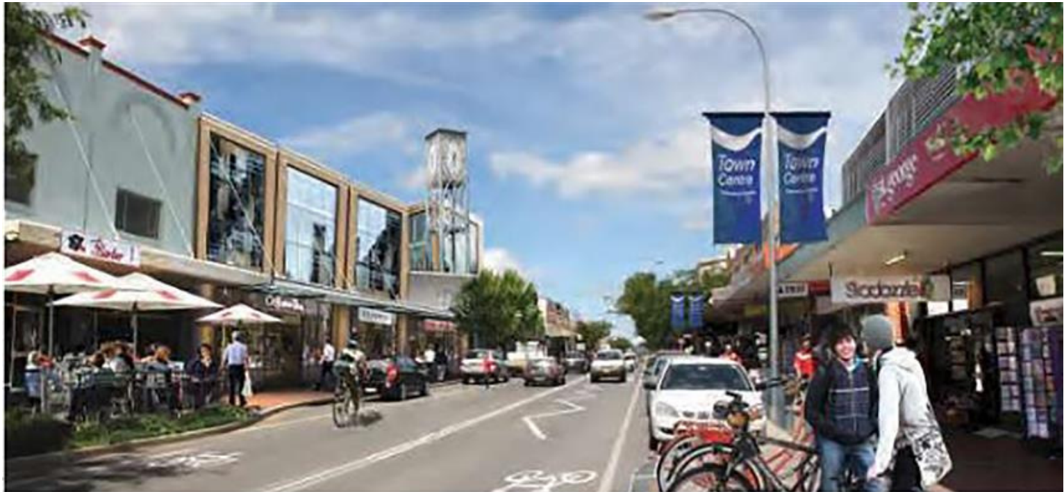
Figure 1. Artist's impression of the potential future look & feel of Vincent Street