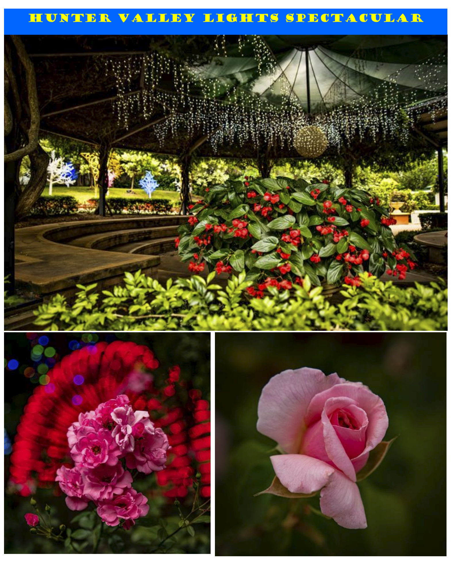
The Rotary Club of Cessnock has completed another week as volunteers at the HVG Lights Spectacular. Interestingly some nights are really well attended by lots of families and children while other nights are really quiet. Well at least it gives us the chance to smell the roses.