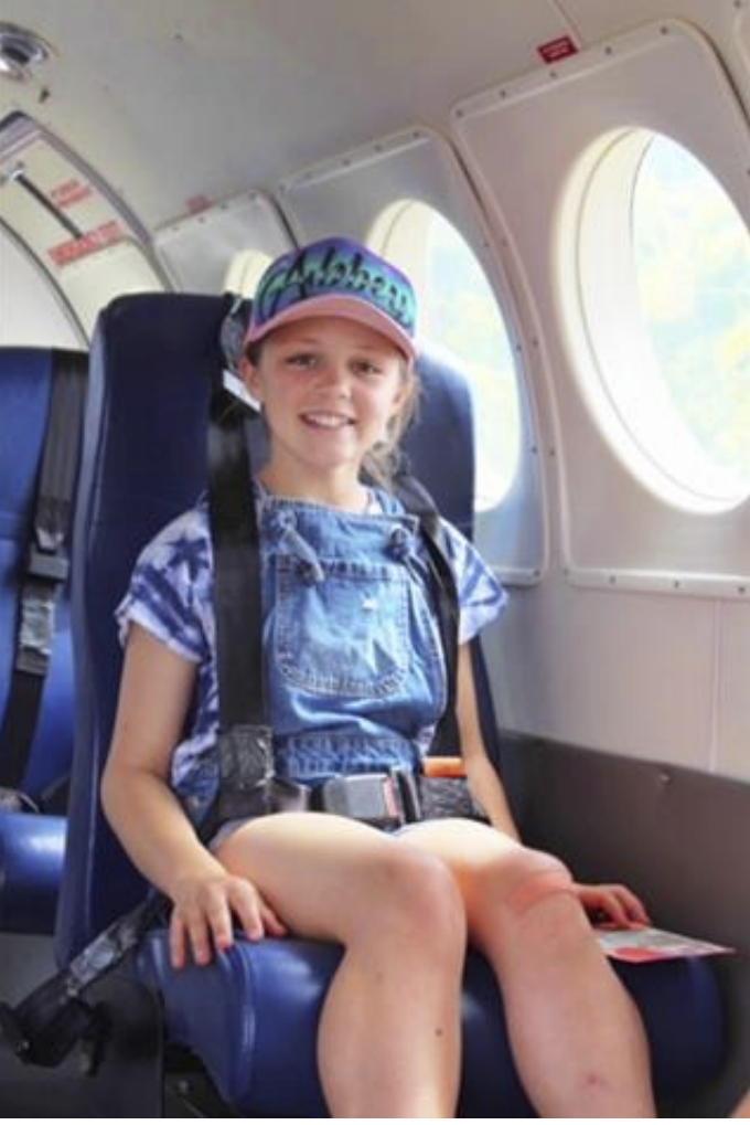
Children at the Taronga Western Plain Zoo and flying on the Royal Flying Doctor Service