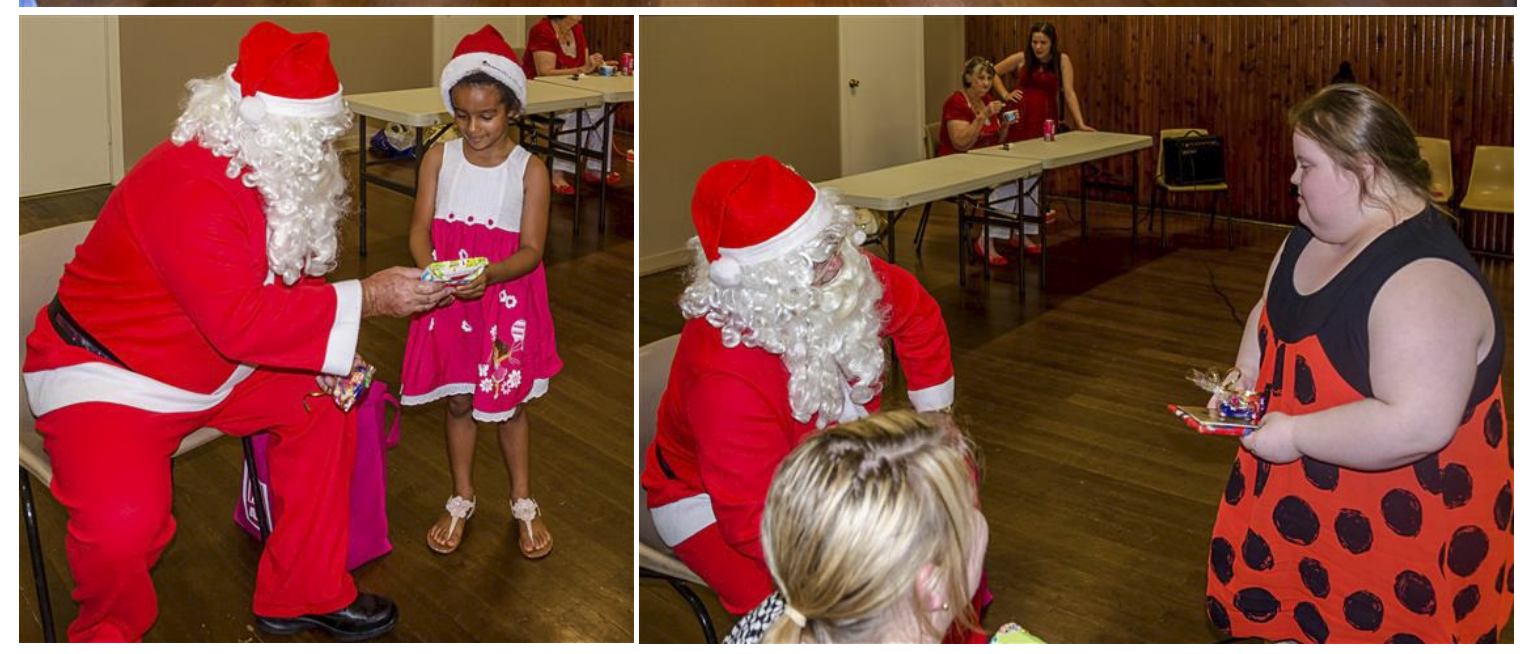
The Christmas season is well and truly with us already. Some exchange students were in that Christmas spirit in the top photos and the children at the Wheeling and Able Christmas party were absolutely delighted to hear the great choir and to have Santa present them with a special gift.