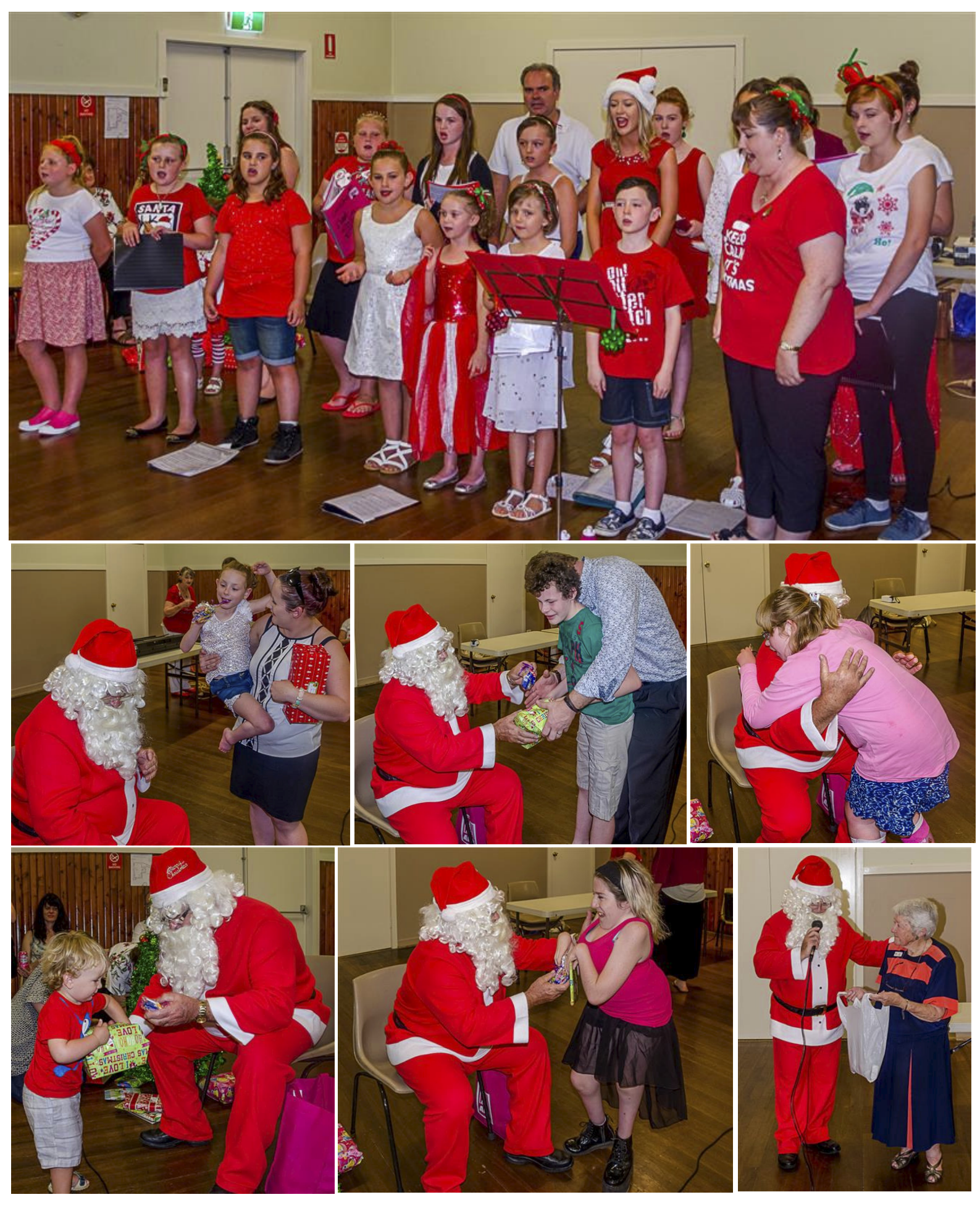
What a fantastic Christmas Party to see the joy on the faces of these very special children. The choir is a real plus every year and there are always so many special moments to capture. Thanks again to our Santa who brings out the smiles on the children's faces. We have so many photos from each year and they may prove to be quite valuable to theses children when they are a bit older and they have a record of their younger days, to look back over. Maybe one year we could present a small album to the group of the previous years Christmas parties.