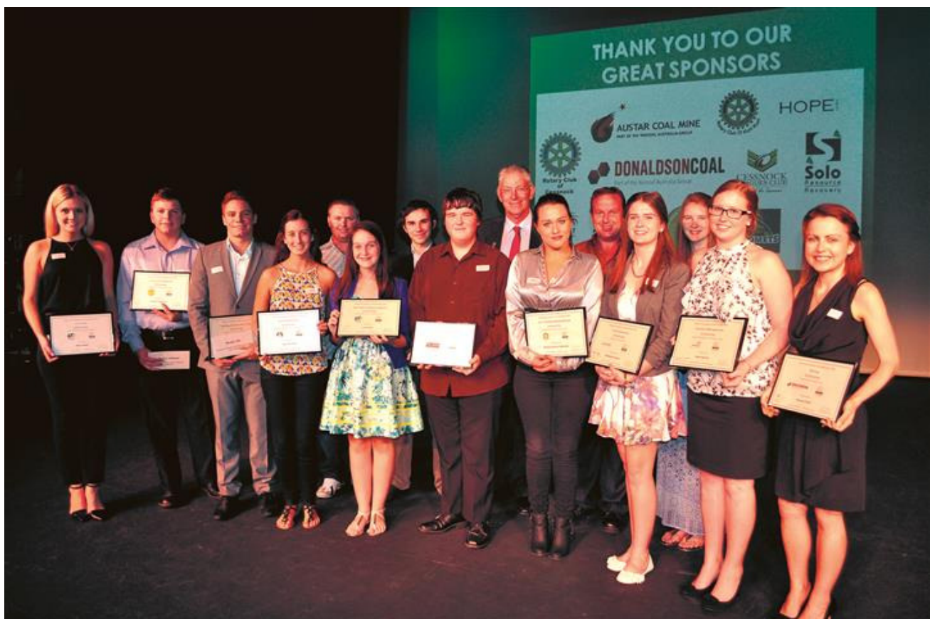
The group of successful candidates at the Cessnock Mayoral Academic Awards night.