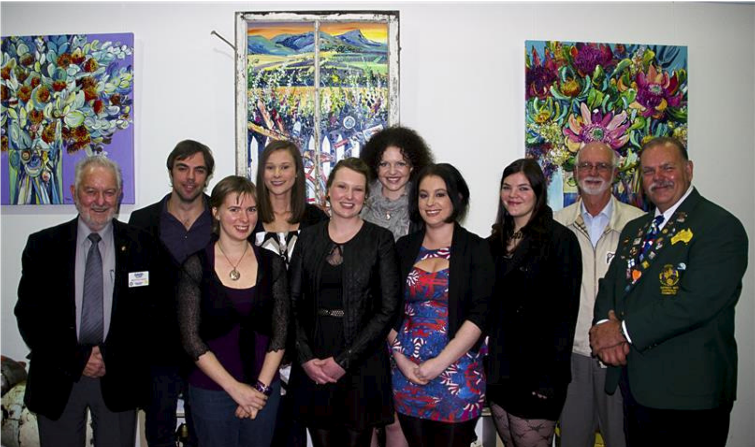
Photo was taken at a recent Changeover and Christmas party at Emmas Cottage.

The general feeling at the meeting was for the Rotaract Club to continue even though the member numbers are very low at present. Membership is very hard to boost in any Service Club these days. We as Rotarians should also look for possible candidates that would make good Rotaractors.