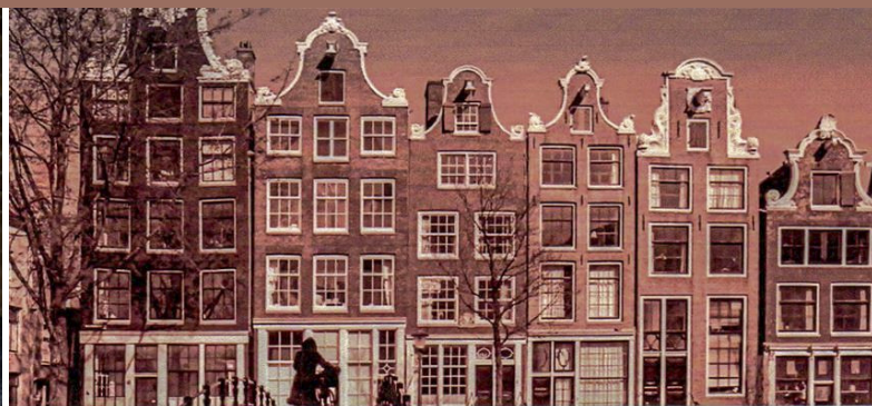
Rotary Club Amsterdam International