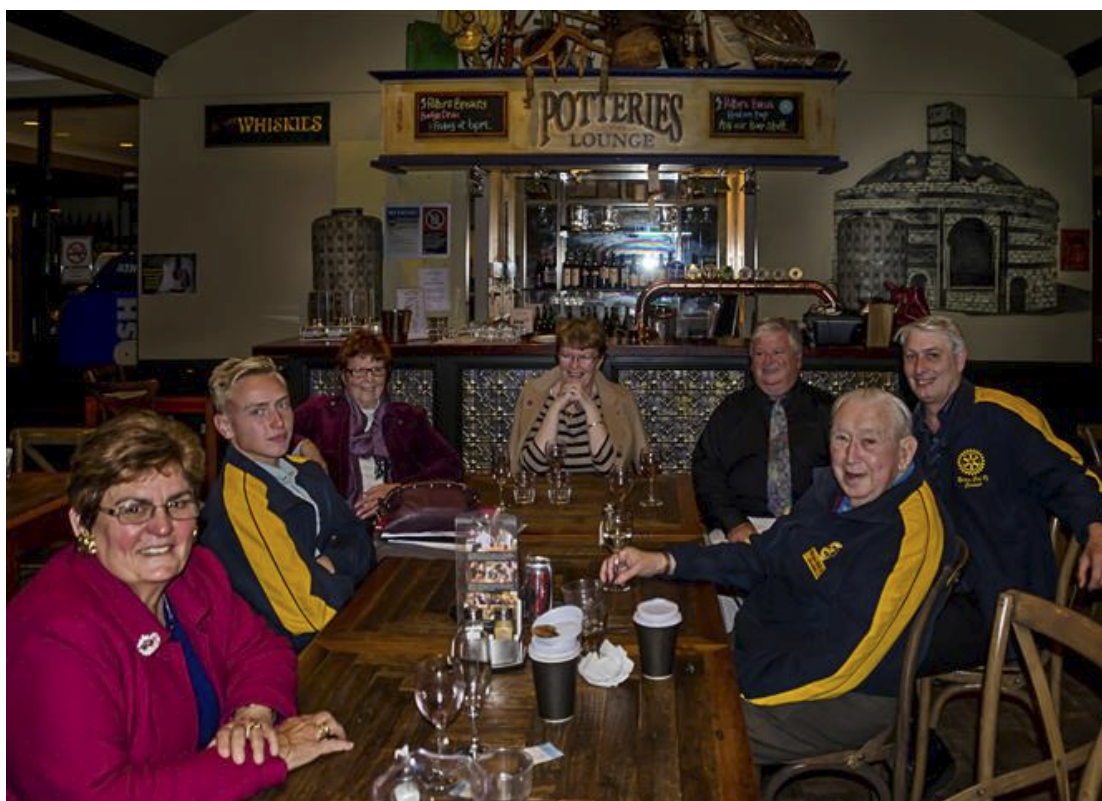
Photo the group who stayed back a bit after the meeting for an extra drink and a chat.

Next week we are being treated to an evening of beer tasting and nibbles prior to our meeting courtesy of Potters, hope you can all make it. The meeting will be at the usual time and partners are welcome.