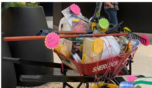
Thanks to Deana for the extra decorations on the wheelbarrow!