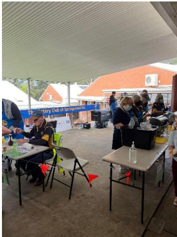
Ellison Rd PS Welcome Back Breakfast