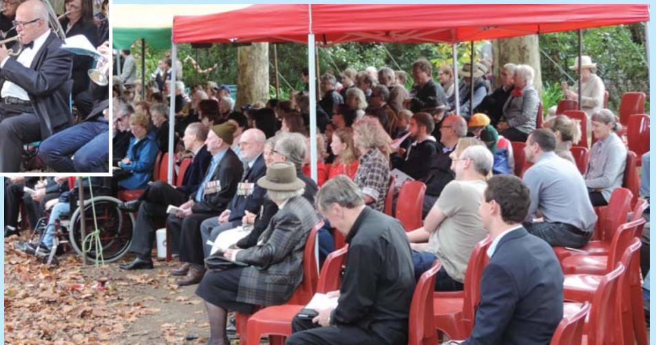
Local residents and Blue Mountains visitors attending the function