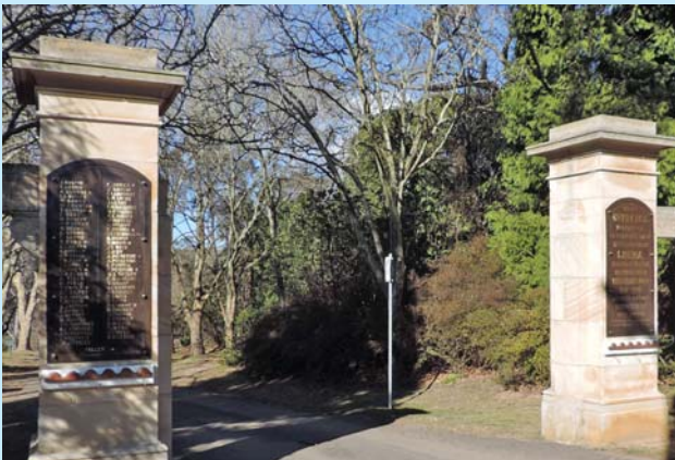
Gates at the entrance to Lone Pine Memorial