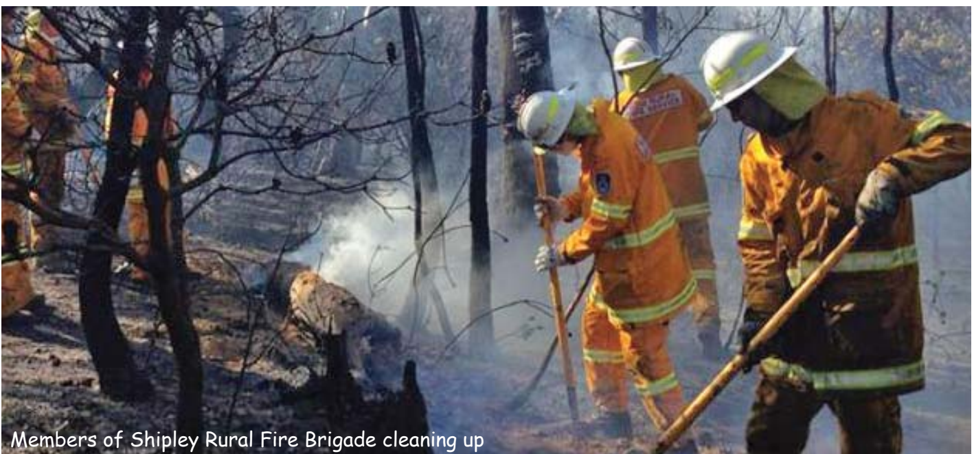
Members of Shipley Rural Fire Brigade cleaning up