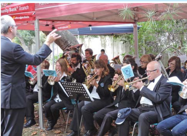
Blue Mountains City RSL Band