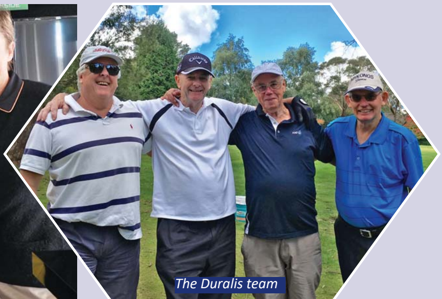
The Duralis team