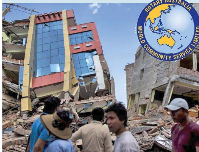
A scene of devastation which occurred when Kathmandu was struck by an earthquake in 2015.

We have been awarded a RAWCS Project Fund (tax deductible donations) to raise A$280,000 to construct a new, enlarged Astha Home for Girls in Kathmandu, Nepal