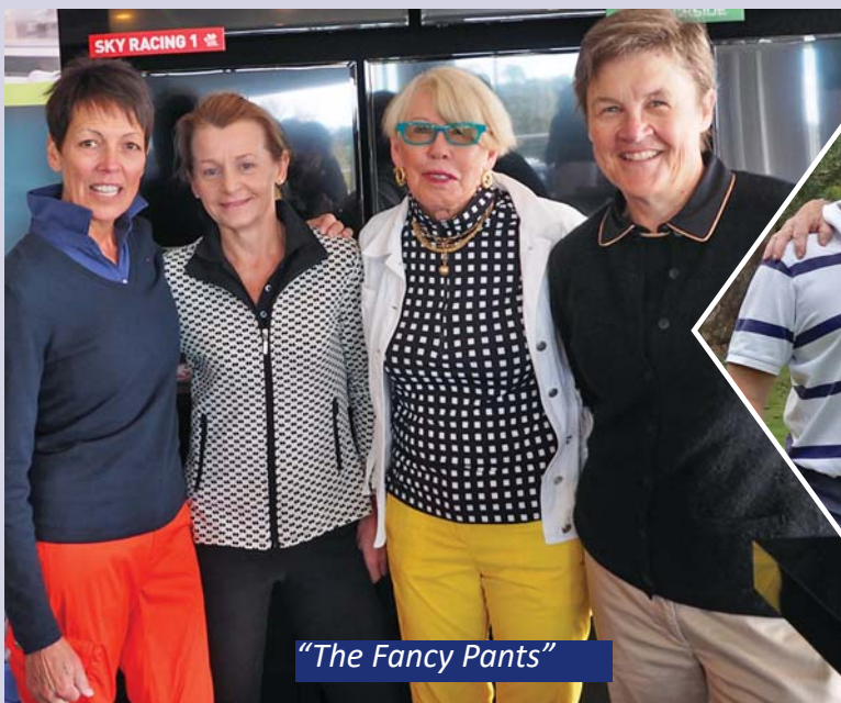
"The Fancy Pants"