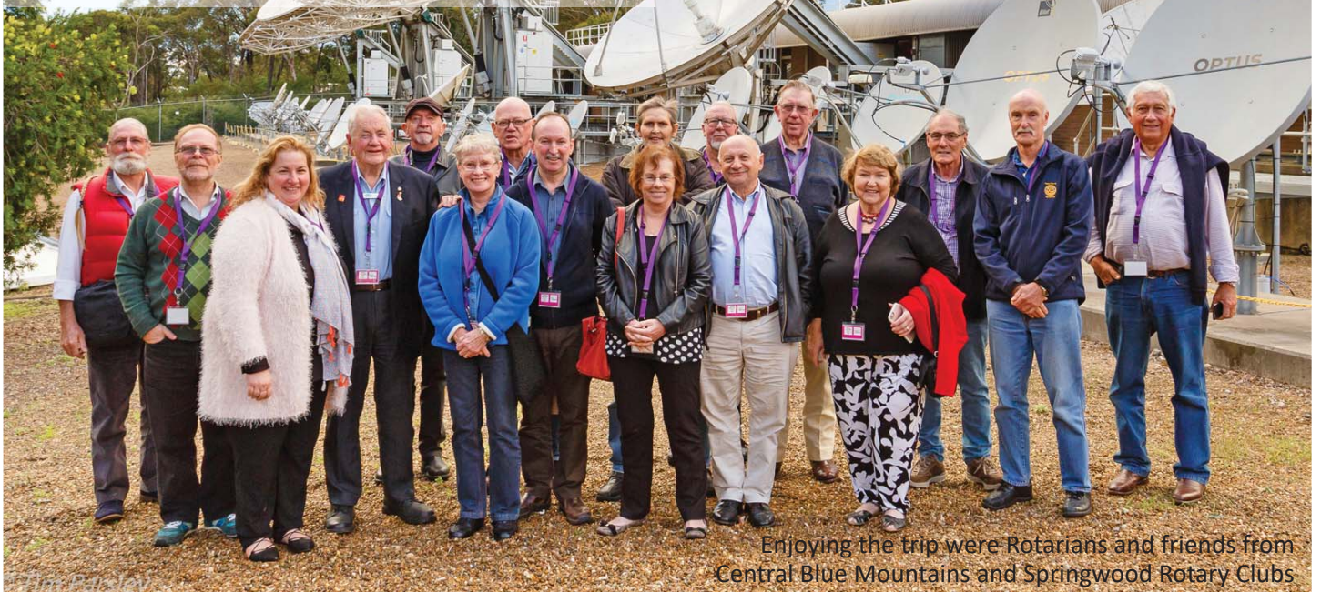
Enjoying the trip were Rotarians and friends from Central Blue Mountains and Springwood Rotary Clubs