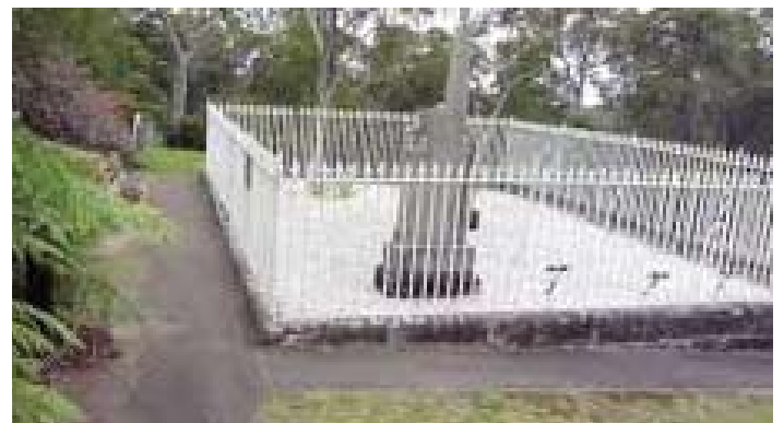
Sir Henry Parkes grave at Faulconbridge

acres in the Blue Mountains and named it Faulconbridge after his mother, whose maiden name was Faulconbridge. He was buried there in 1896 next to his first wife Clarinda. Clarinda Falls at Faulconbridge is named after her.