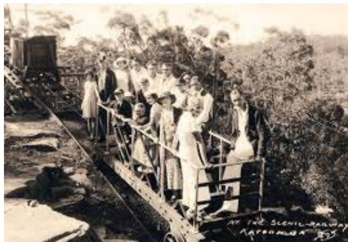
The Mountain Ghost remembers when the Scenic Railway was known as "The Mountains Devil".

So if you have not been to Scenic World in the last five years then do yourself a favour ....and pay a visit.