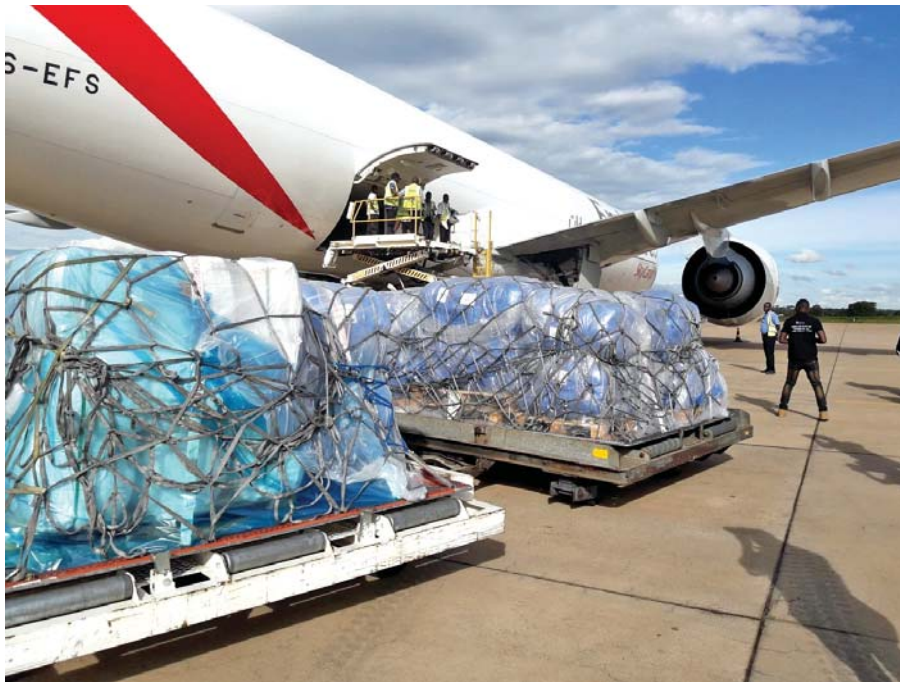
ShelterBox aid arrives in Malawi from the UNHRD warehouse in Dubai

This month, ShelterBox is focusing on Africa, a continent of extremes. Cyclone Idai, which swept through Southern Africa, caused catastrophic damage in Mozambique, Zimbabwe, and Malawi, affecting more than 2.5 million people and left more than 1,000 dead and thousands more missing. The first cases of cholera have been reported in Mozambique, accentuating the need for clean water.