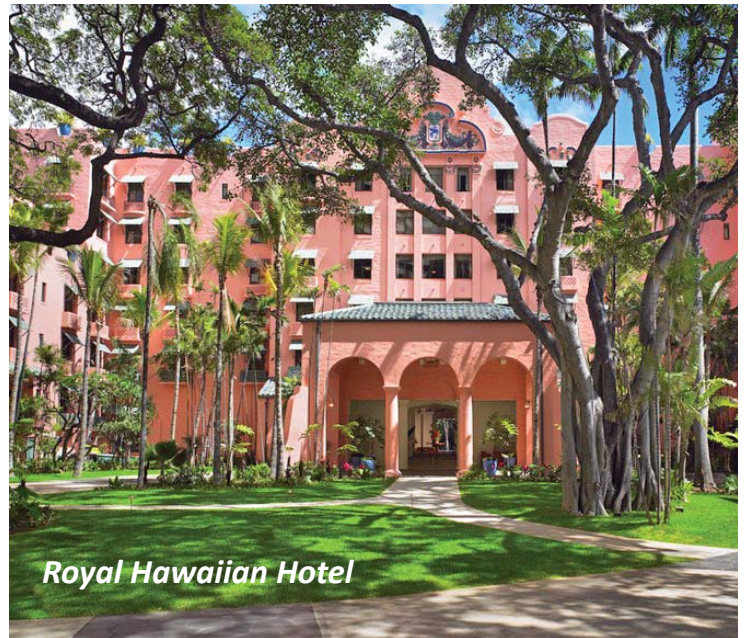
Royal Hawaiian Hotel

"Please come and join us for one of our meetings. You will find the friendship and variety of vocations represented by our members to be encouraging, thoughtful, and hopefully