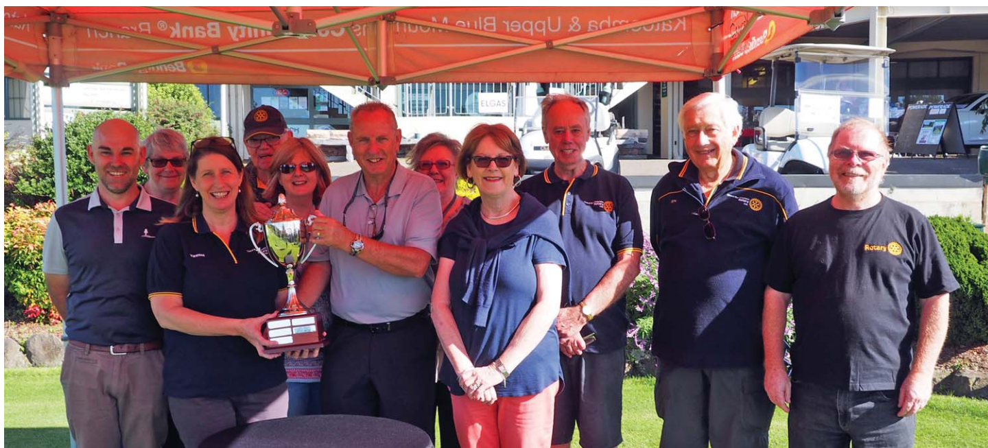
Central Blue Mountains Rotary and Greystanes volunteers: Central Blue members provided breakfast for 80 golfers and volunteers. NSW Governor David Hurley started the day by hitting a great shot from the first tee. Money raised will be used to purchase a much needed vehicle from Blue Mountains Mazda, to transport clients to medical appointments.