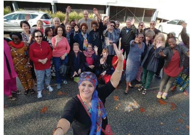
Photographs from a similar cultural exchange weekend held last year by the Rotary Club of Corowa NSW