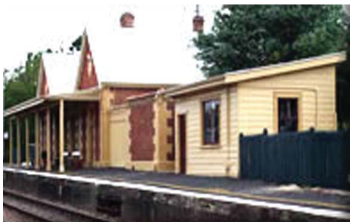
Rydal Train Station building has been converted to a library

Ghost Rating: 8/10 (depending on weather)