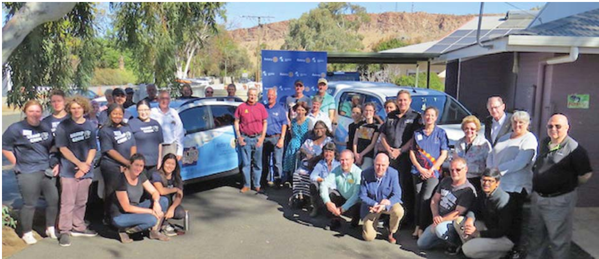
Purple House staff with Rotary members and officials, some from interstate, during the handover of the vehicles.