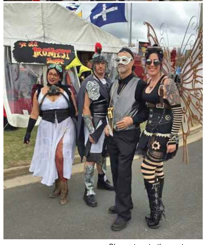
Please turn to the next page