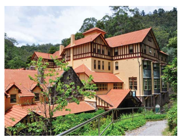
Jenolan Caves House, the historic hotel built in 1897