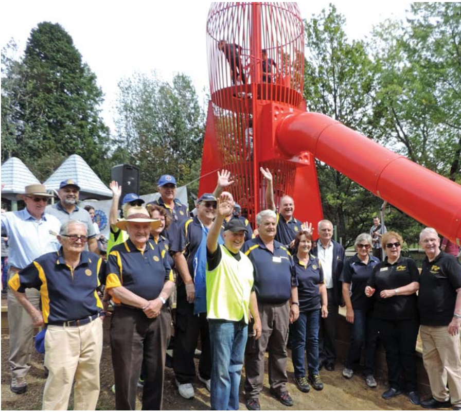
Rotarians at the launch representing clubs across the Blue Mountains