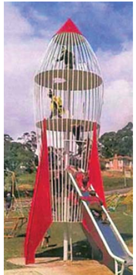
The original Rocket C1962

In 1997, for safety and insurance reasons, the Rocket along with other heritage playground equipment was removed.