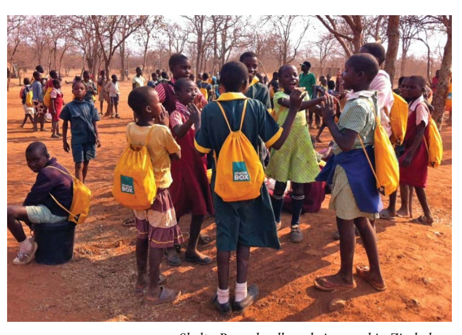
ShelterBox schoolbags being used in Zimbabwe

SchoolBoxes have also been deployed to Zimbabwe for children displaced by the country's worst flooding in forty years.