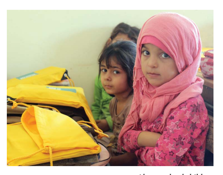
Aleppo school children

Schoolbag sets were even delivered right into war-torn Aleppo city. By including SchoolBoxes, along with essential items such as hardwearing tents, winter clothing and blankets, ShelterBox is helping a generation of children continue their education and create a sense of normality.