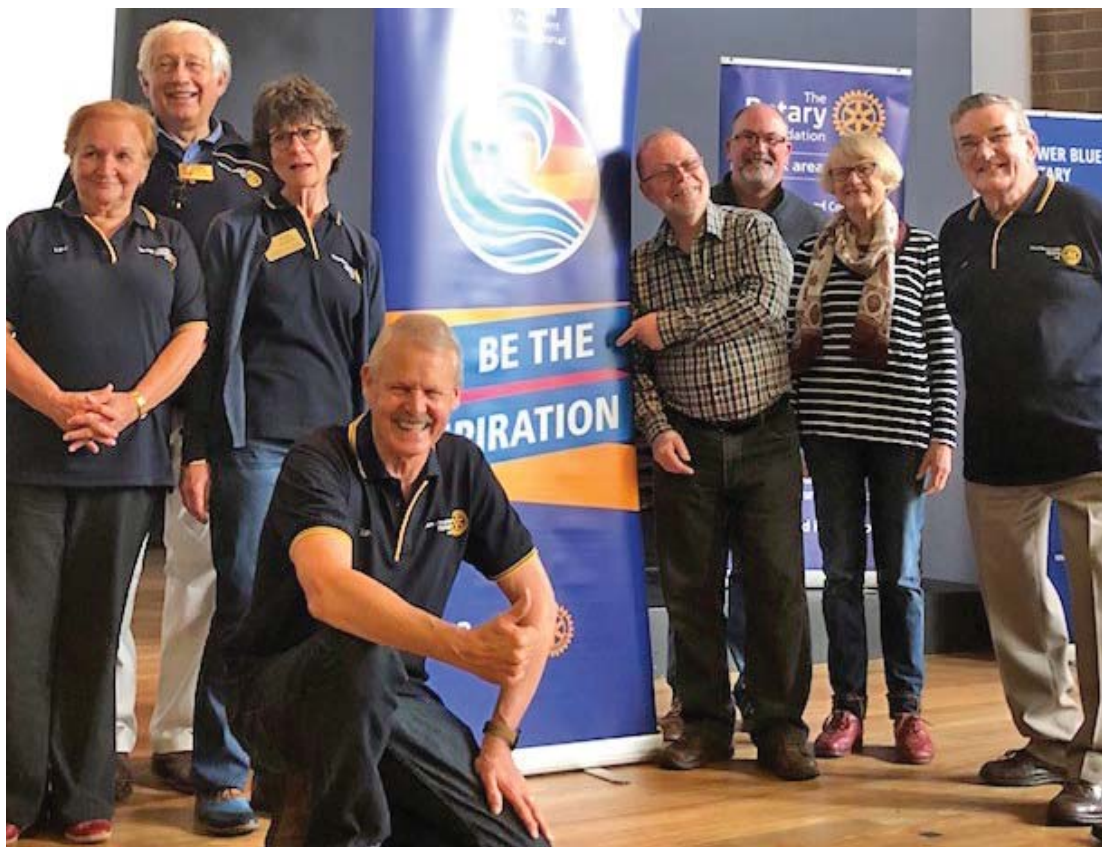
CBM Rotary team at the 9685 District Assembly, April 29.