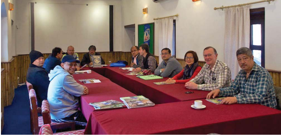
Attending a meeting of the Himalayan Patan Rotary Club, Kathmandu