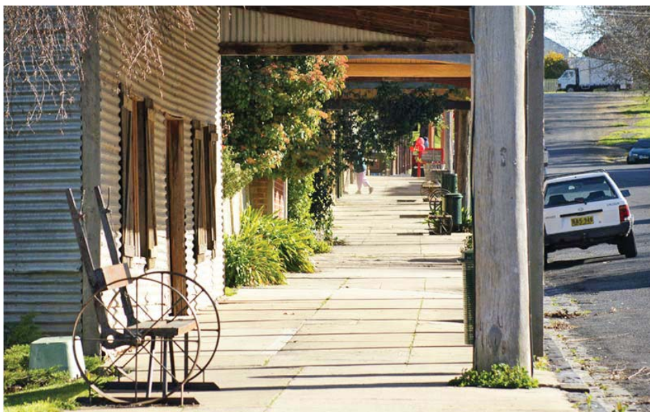
Main Street, Millthorpe - morning peak hour

The Ghost really recommends you visit the place. It is very quiet on weekdays but is very busy at the weekends