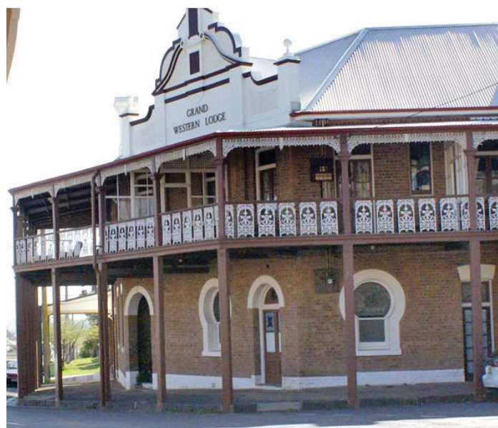
Grand Western Lodge, Millthorpe - local pub