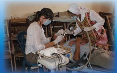
Funding medical and dental programs