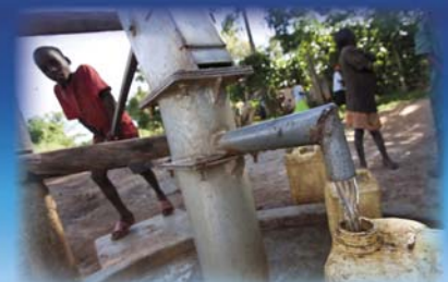
Providing clean water