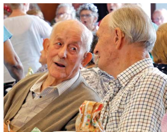
Aged care services