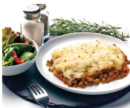
Vegetable Lentil Cottage Pie

BMFS is not-for-profit organisation providing aged care and disability services, volunteering opportunities, a social enterprise café and more to residents of the Blue Mountains.