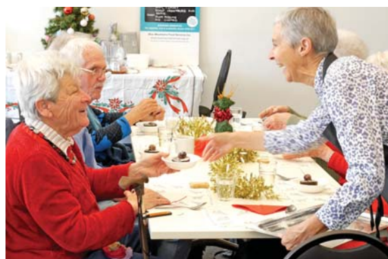
Community restaurants at Blaxland, Springwood, Lawson, Katoomba and Blackheath.

Tucked away in Ben Roberts Cafe, at Lawson, a small team of "Cook + Connect" dedicated chefs and support workers make a big difference to the lives of young people with a disability.