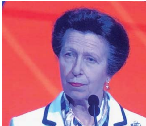
Britain's Princess Royal, Princess Anne