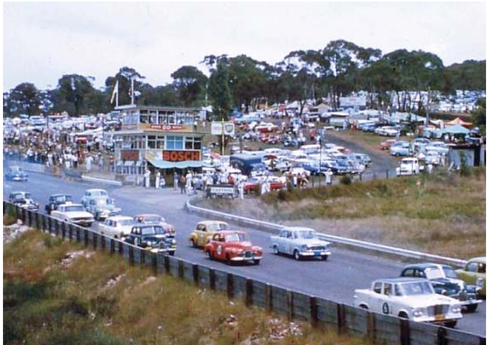
Catalina Park Raceway in the sixties

People would pay to visit the Catalina and speed boat rides were carried out on the lake. There was a Ferris Wheel, Tearooms, Swimming Pool and Cinema. The Government bought the amusement park in 1952 and had the Catalina