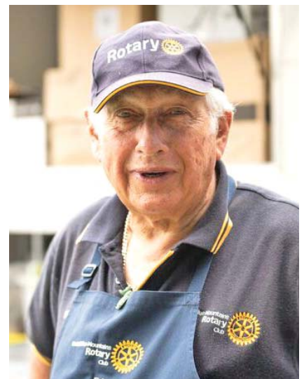
Eric Cantor - Central Blue